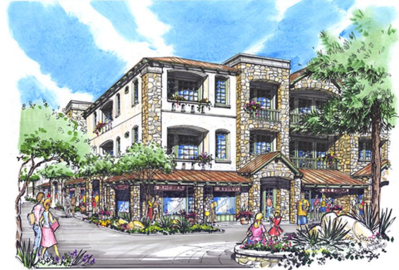
Rendering by Hector Uribe