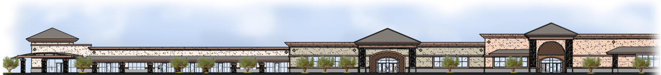
Conceptual Building Elevations

LVA provided planning and design services including site investigation and analysis, rezoning plan preparation, and precise site planning. Additional services provided included landscape design and master plan, conceptual architectural elevations and theming, and team coordination for drainage analysis and utility service analysis. A comprehensive sign plan was also completed by LVA to maximize and allow future flexibility in determination of monument and building sign sizes and locations. A phased, modular site design approach was incorporated to provide ample opportunity for the future developer in targeting desired commercial users.