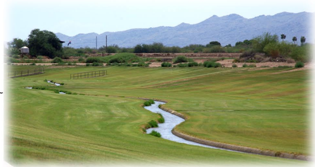
Completed Laveen Drainageway