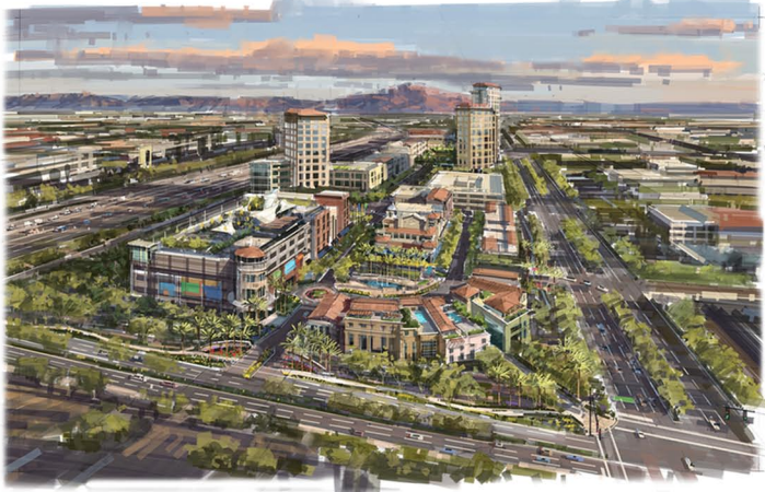
Project perspective (view to the south)

LVA's responsibilities include conceptual and formal site planning and design, rezoning services, landscape, hardscape and amenity design, marketing presentation graphics and public participation coordination.