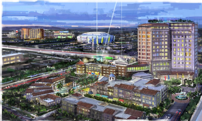
Project perspective (view to the northeast)